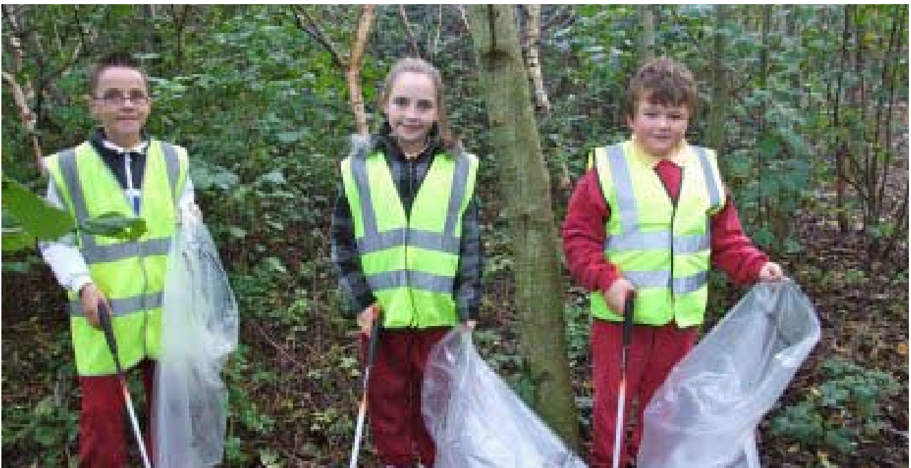
Volunteers at the first Glan Suas Gaillimh clean-up