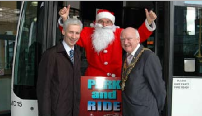
Launching the Park n Ride scheme