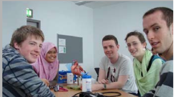
Members of NUIG Slainte Society who provided a 50c health clinic for Healthy Living Week